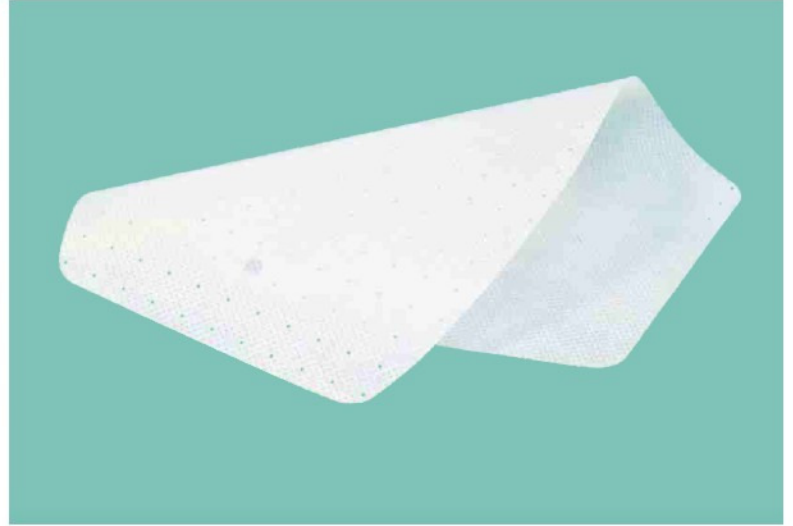
2D Reinforcement Prosthesis Microval Intra

MICROVAL INTRA çift taraflı kompozit protez olup, intra-peritoneal yaklaşımlarda, evantrasyon veya umbilical hernia tamirinde kullanılmaktadır. 70GSM densitivlik 100% nonwoven polpropylen, bir tarafı silikon ile kaplanmış, yapışıklık önleyici meshdir.